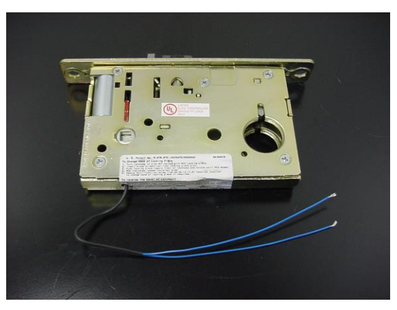
STEP 1 : REMOVE 5 EACH COVER SCREWS AND REMOVE COVER.

TO CHANGE THE LOCKING FUNCTION FOLLOW THE INSTRUCTIONS BELOW CAREFULLY.